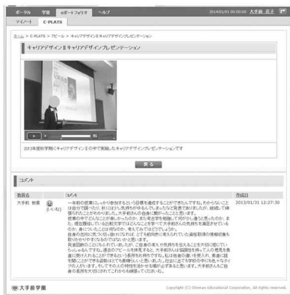
Figure 3: Sample of comments on a presentation

“My note” is also a portfolio, where students save reports, presentation materials, papers, and other coursework. It allows students to organize and store all their educational output for review. “My note” is well coordinated with our LMS. All reports and writing assignments turned in electronically are automatically stored in “my note” with feedback from the teachers (Figure 4). Hand-written reports, as are often used in many classes, can be stored in “my note” electrically by putting a mark-sheet sticker on the handwritten paper and scanning it. Management of educational materials used to be left up to each student but this system was inadequate. However, our new system makes it easier and helps students to better organize and store all their materials in one place.