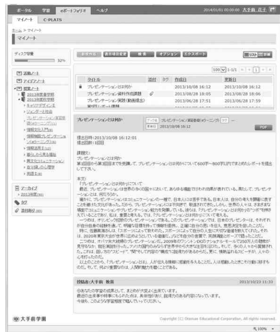
Figure 4: Sample from “My note”