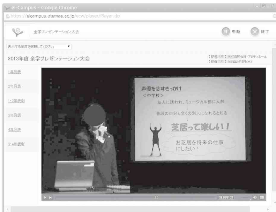
Figure 1: Sample of video portfolio content

classmates, their teacher and educational volunteers. This presentation is followed by a question-and-answer session. All presentations are recorded and stored in el-Campus and judged in a preliminary viewing for an all-campus presentation competition. Each presentation is graded by the student's classmates on a scale of 1 to 5, using the criteria given in Table 1. Based on their evaluations, each class chooses a representative, who proceeds to the second round. If they are successful in the second round, the student then moves into the final. Presentations that are given in the final round of the competition are posted on el-Campus and shown to all students as good example (for an example, see Figure 1) . Each student uses his or her presentation footage to review for self-assessment and to see how far he or she has achieved their goals on a rating scale within the e-portfolio function, as will be discussed below. Teachers and educational volunteers also make full use of materials stored on el-Campus for effective feedback.