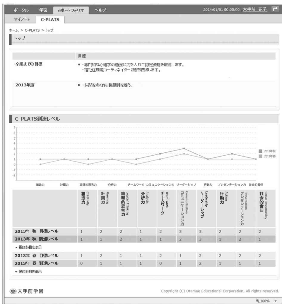
Figure 2: Sample of the C-PLATS tab

“C-PLATS” is the core system in our work-ready, ability-building education, which helps students track their progress in their studies. By using this portfolio, each student sets yearly goals, long and short-term objectives in C-PLATS competencies, finds personal appeal points, and reflects upon their activities and performance as a means to guide himself or herself to a higher level (Figure 2). The contents put in “C-PLATS” by each student are shared with their teachers and educational volunteers, who also input comments, advice, or encouragement using el-Campus as an important communication channel (Figure 3). The presentation footage in Figure 1 above, for example, is placed in the personal appeal section of “C-PLATS” with comments from the student. Educational volunteers can come to class and advise students in person, or they can give advice from home by visiting the student’s portfolio and checking the contents on el-Campus. This system makes feedback easier and enables volunteers who cannot come to class, as is often the case with people working in society, to expand their participation and guidance activities.